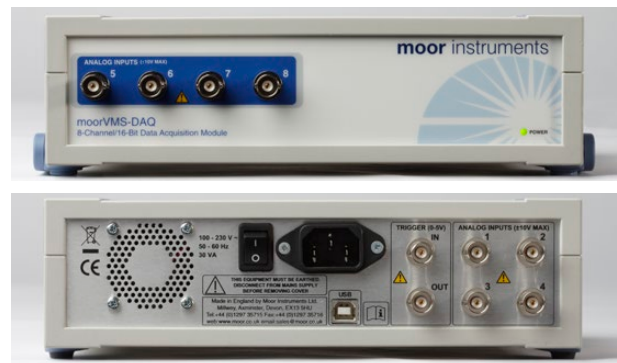
moorVMS-DAQ™ panels - back panel analogue outputs 1-4 and digital triggers, front panel analogue outputs 5-8.